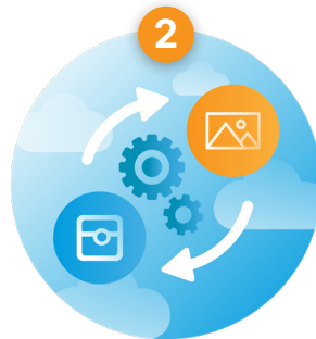
Photo-document and measure the property details with the iGUIDE PLANIX camera system.