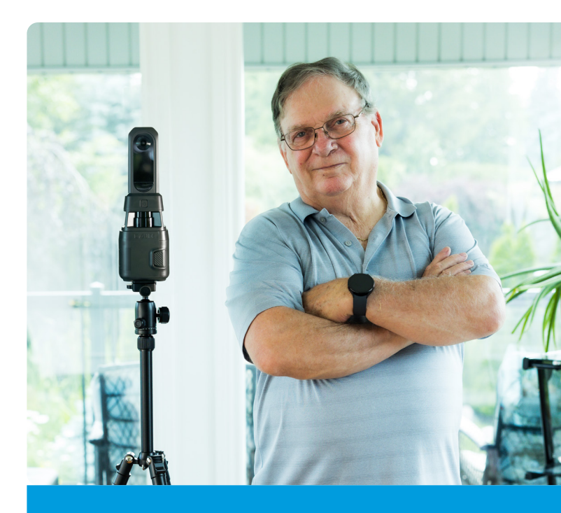
"iGUIDE is a game-changer for me."

Are you ready to embrace iGUIDE? It can help you maximize efficiency, increase client satisfaction and reduce operational costs.