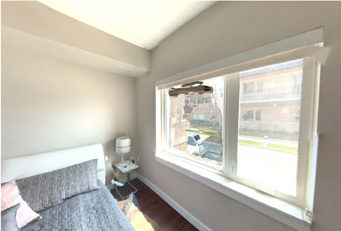
Typical stitching artifacts in a 3D tour captured with iPhone with lidar.

capacity in mobile devices, especially when intensive image processing is involved. In addition, the lidar range on the new iPhone is about 5 meters. Because of these constraints, capture with handheld devices is most applicable for small spaces like a room and these devices can hardly compete to be the most optimal tool for capturing a complete house and even less so when multiple houses per day need to be captured by a busy photographer.